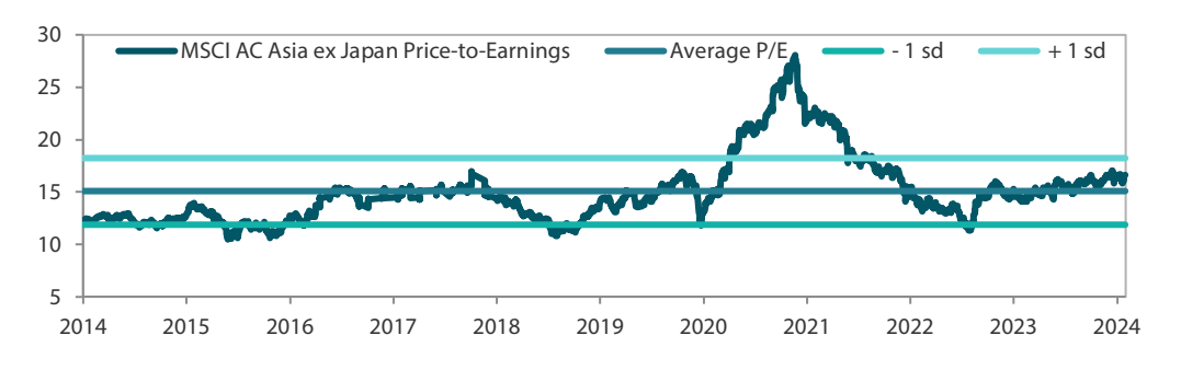
Chart 4: MSCI AC Asia ex Japan price-to-earnings

The world is fast entering another consumer tech cycle. This time, it is being driven by consumer devices with Al capabilities. This trend is expected to trigger another upgrade cycle as Al-capable devices require newer chipsets. Taiwan and South Korea, being the global centres of tech manufacturing, especially in semiconductors and related fields, stand to benefit from this new cycle. The trajectory is a long one as Al-capable tech transitions from being in high-end devices to mass-market devices. We all await that breakthrough application that will drive the next wave of growth.