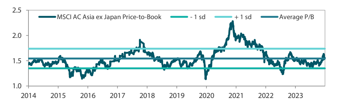
Chart 5: MSCI AC Asia ex Japan price-to-book

Ratios are computed in USD. The horizontal lines represent the average (the middle line) and one standard deviation on either side of this average for the period shown. Past performance is not necessarily indicative of future performance.